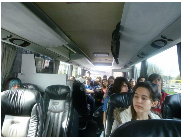
Guided Tour Berlin

In Berlin, upon arrival, the bus and the guide were waiting for us to start the bus tour around Berlin, although sometimes we stopped to see, for example the Reichstag, the Brandenburg Gate, the Holocaust Memorial, the Wall, etc..