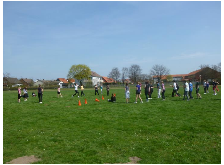
PHYSICAL EDUCATION AND SPORT LESSON