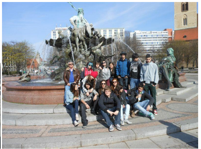
Unter den Linden

The next day morning we visited the Museum Island, starting at Pergamon Museum, then the Neues Museum, and finally the Alten Museum.