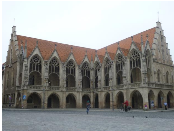
OLD TOWN HALL