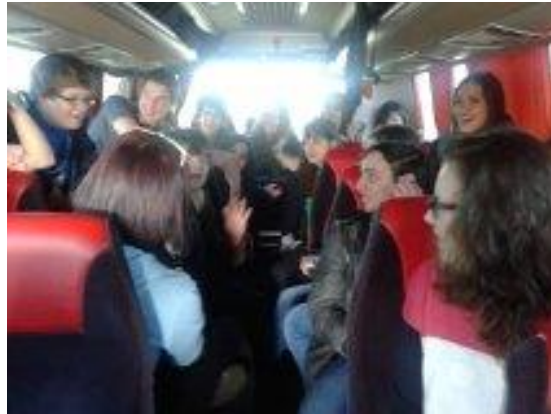
Camino de Barajas

In late April we left for Berlin, 19 male / female students including 15 from 1st year Bachillerato, 4 students from 4th ESO and 1 student 2nd year Bachillerato, changes brought low for various reasons.