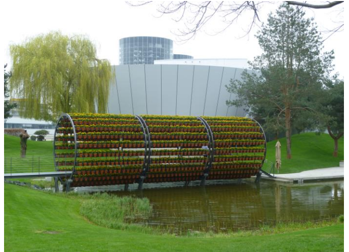
WOLFSBURG. AUTOSTADT VOLKSWAGEN