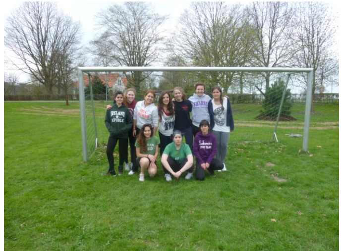
AND THEN... A FOOTBALL MATCH