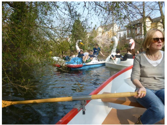
ROWING AND CANOE/PEDAL BOATS