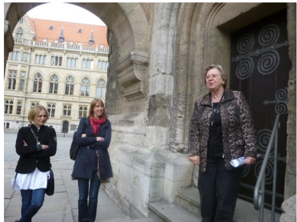
GERMAN TEACHERS and GUIDE